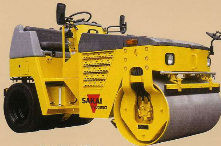
Combined Type TW350-1 2.5ton/1.2m (5,400lbs/47")