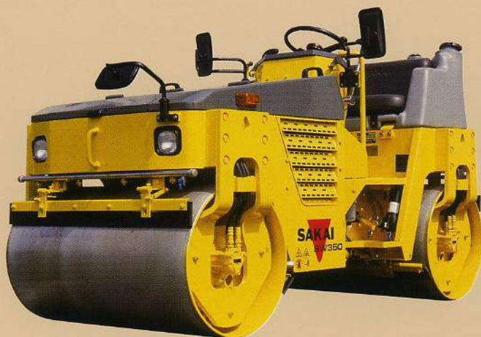
Double Drum Type SW350-1 2.8ton/1.2m (6,060lbs/47")

Compact yet bold design, articulated vibratory rollers, double drum type and combined type.