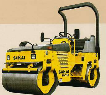
ROPS Type (Option)